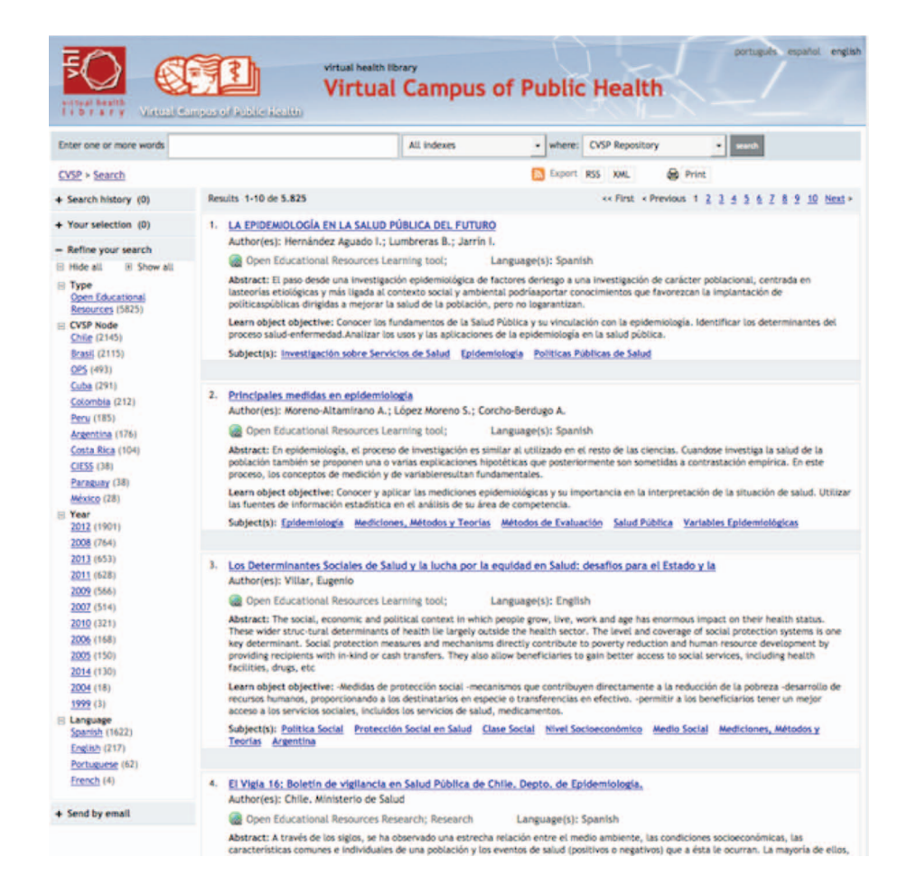
Figure 2: The VCPH virtual health library

VCPH maps fairly well onto the OPAL matrix, due to its extensive use of OER, its provision of MOOCS and self-directed open courses and its open policies. VCPH is a collaboration between over 100 institutions and organizations and since 2003 has assembled a multilingual online library of 190,000 items in total, with 5800 identified as OER (see Figure 2).